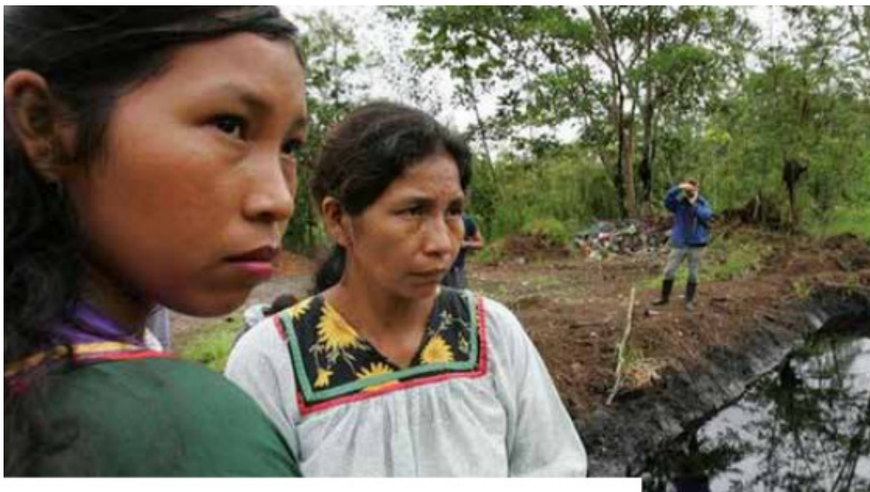
Indigenous people in northeast Ecuador at one of Chevron's 900 toxic waste pits that continue to leach into the water table.

compensation was more than $29 million (21.3 million pounds) and his Chevron stock holdings are valued at about $167 million (123 million pounds). Sixty percent of the inhabitants of Chevron's polluted Lago Agrio live in poverty.